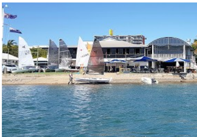
The view from the water

Articles reflect the personal opinions of authors and contributing persons, and may not reflect those views of the PCSC.