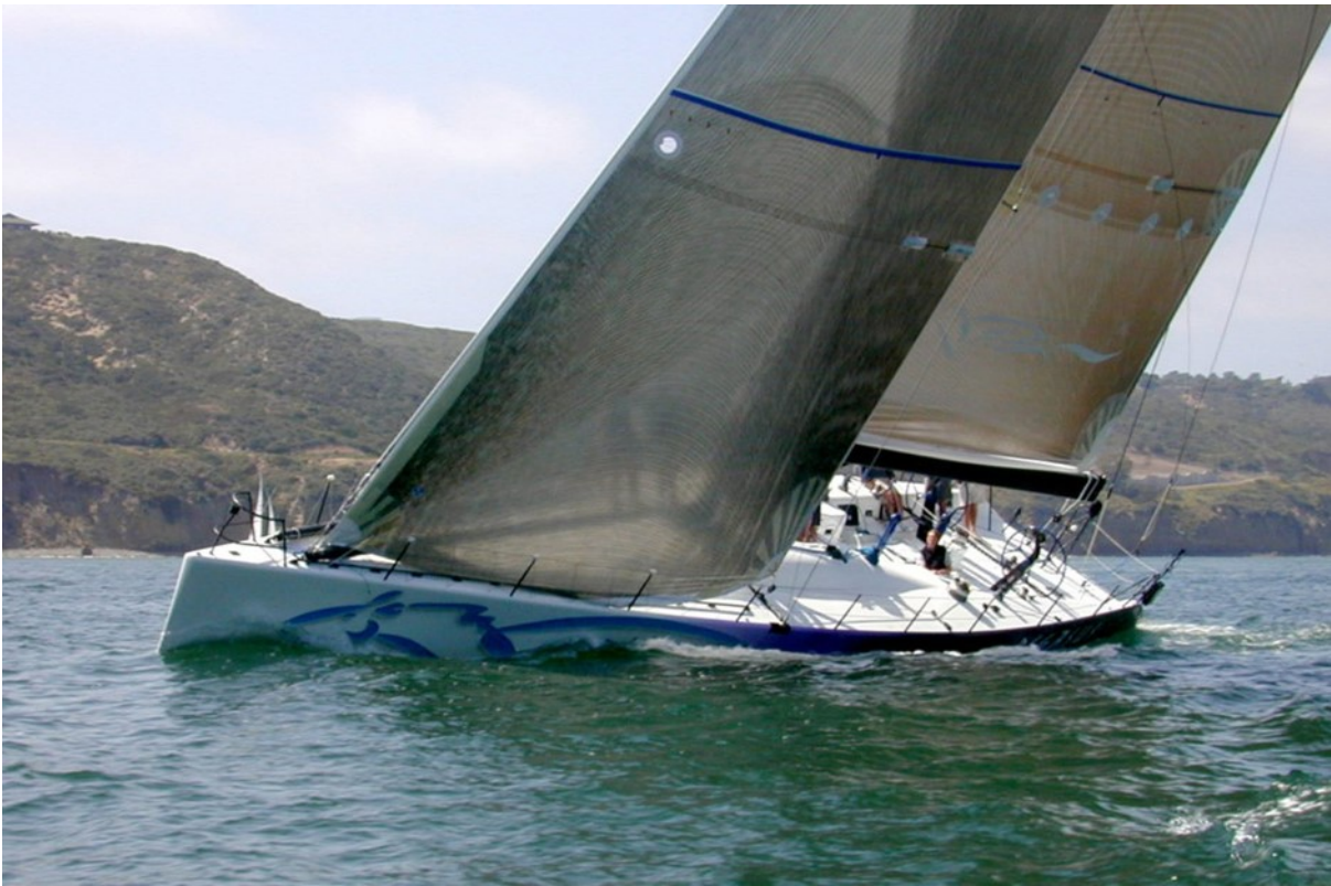
Reichel Pugh 75' Black Dragon

"But the really cool thing was finding out that mainly these people were very nice and friendly individuals. Despite all they had achieved, they were easy to talk to and more than happy to unload information to the young guys coming through like me."