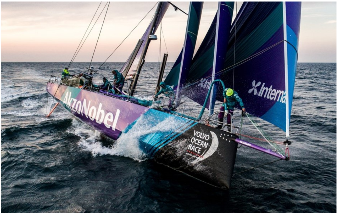
Team AkzoNobel during the 2017-18 Volvo Ocean Race passing the Fastnet Rock