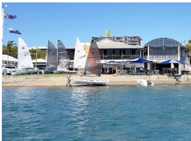
The view from the water