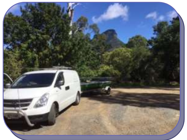
We stayed for one more night and took the long way home!