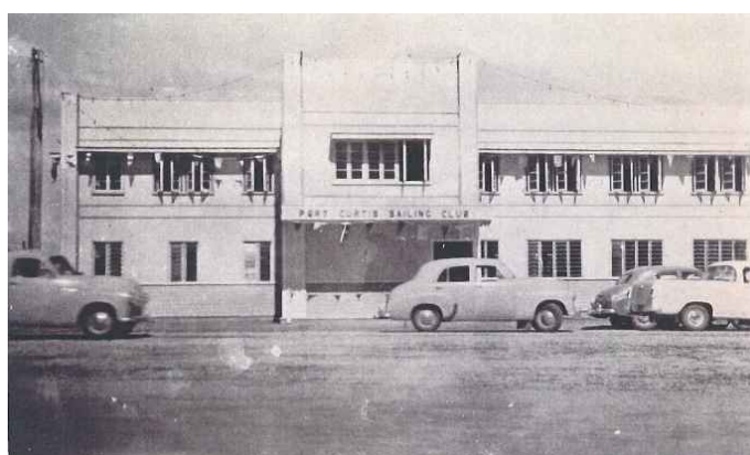
Easter weekend at the clubhouse 1959