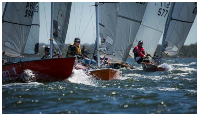
It was a hectic mid-fleet