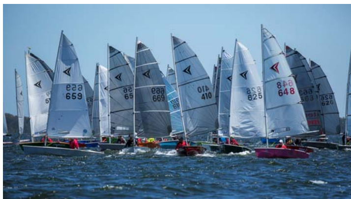
A start line early in the regatta