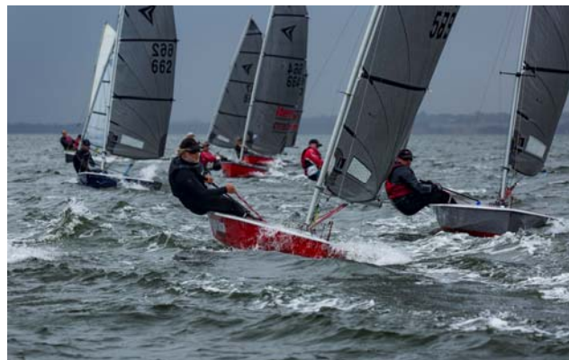
It was close racing