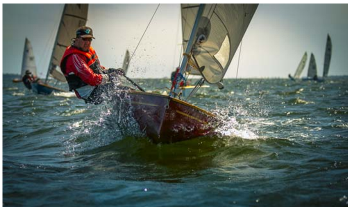
The light was soft in the late afternoon