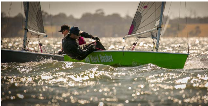
The Impulse fleet are colourful