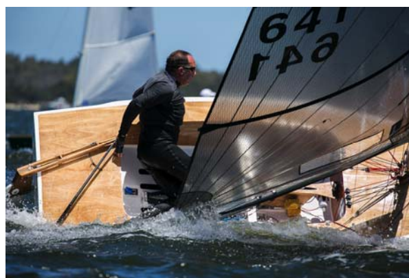
There were spills as well